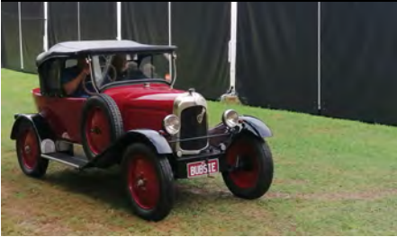
Bubsie 1 @ Grey Nomads

We also attended the NSW Big Camp in April and assisted in running the display of "Bubsie 1" there and repeated that in May at the Grey Nomads convention. We then travelled up to the Gold Coast for the Incredible Journey Partnership weekend and spent a few days relaxing with friends there.