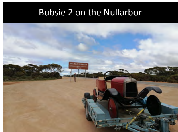
Bubsie 2 on the Nullarbor