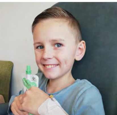
Banner's breakfast after last operation