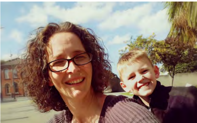
Orelle & Banner - discharged from Wellington Hospital